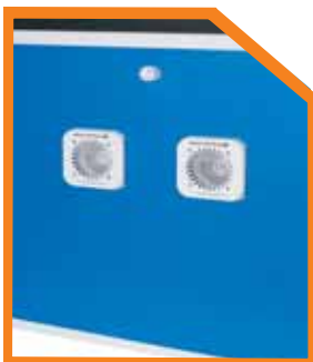
Two BaduStream jets combined. Illustrated in a wall panel.

All BADU ® STREAM /pump combinations include control box with air button and 50 ft. air tubing. 4" or 3" plumbing is required, depending upon BADU ® STREAM package chosen. Read all instructions before installing.