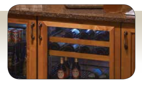
All models are available to order with fully integrated doors and drawers that come ready to accept custom wood overlay panels.