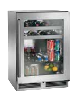
24" Signature Series Beverage Center HP24BO-3-3R (shown)