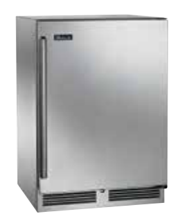
24" Signature Series Freezer HP24FO-3-1R (shown)

To top it off, Perlick's 15-inch Clear Ice Maker produces crystal clear top hat shaped ice, free of impurities that could alter your beverages taste. The unique top hat shape cubes also help to prevent clumping, which is commonly seen with traditional crescent and cube-producing machines.