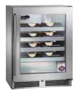
24" Signature Series Sottile Wine Reserve HH24WO-3-3R (shown)