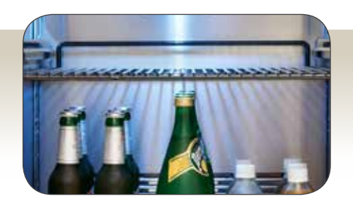
Stainless steel interiors and exteriors provide the industry's most sanitary and durable surface. It makes cleaning easy and keeps cabinet cooler than those with a plastic liner.

A Perlick isn't just an undercounter refrigerator. It's refrigeration that strikes the perfect balance between robust, yet efficient, cooling technology and sleek aesthetics that are visually pleasing. We use only the highest quality materials and finishes to produce our beautiful cabinets, and feature the industry's most powerful refrigeration system. We also take engineering measures to make sure our products are, not only dependable, but also long lasting. We view a Perlick as an investment, not a purchase, and that's why we offer a variety of standard features to extend the life of the product, as well as provide energy efficiency you won't find with competitor brands.