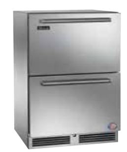
24" Signature Series Refrigerator Drawers HP24RO-3-5 (shown)

Proper preservation of fresh ingredients is made simple with Perlick's full line of 15- and 24-inch outdoor refrigerators . Store meat and vegetables for the grill, components for a refreshing fruit salad, and cold beverages for your guests in your outdoor entertaining space. All models are available with choice of door or set of drawers, including glass door that features Low-E, UV-coated glass to keep products visable without sacrificing insulation and protection.