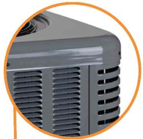
Super Durable Heavy Duty Steel Case

Avoid expensive replacements and make a Raypak the last heat pump you need to buy. Its compact design features a durable steel case, made to withstand common corrosion and direct impact.