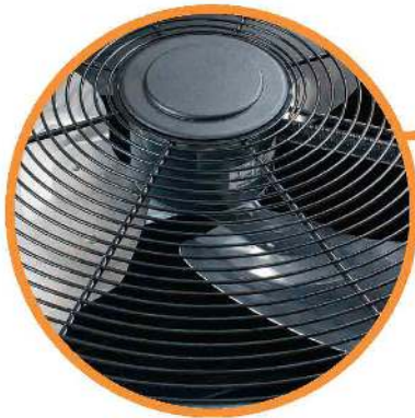
Ultra-Quiet, Swept Wing Fan