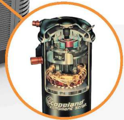
Long-Lasting Copeland Compressor

Our durability goes beyond the surface, too, with a titanium tube heat exchanger that's practically indestructible. Other manufacturers use cupro-nickel that cause costly maintenance or even worse – replacement.