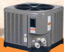
Compact Series Heat Pump Model 2450 shown