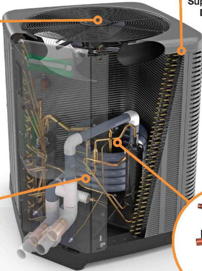
Classic Series Heat Pump Model 6450 shown