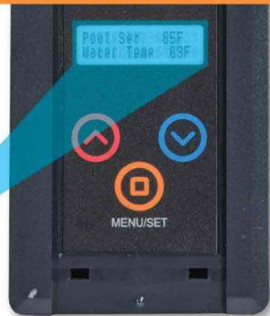
Control Panel Detail