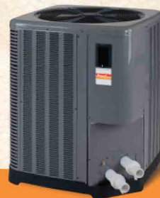
Classic Series Heat Pump Model 6450 Shown