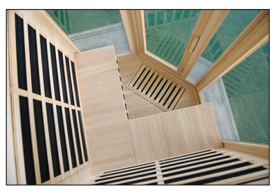
View of sauna inside from above