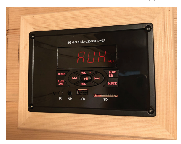
*Other "MODE" options include radio, USB & SD