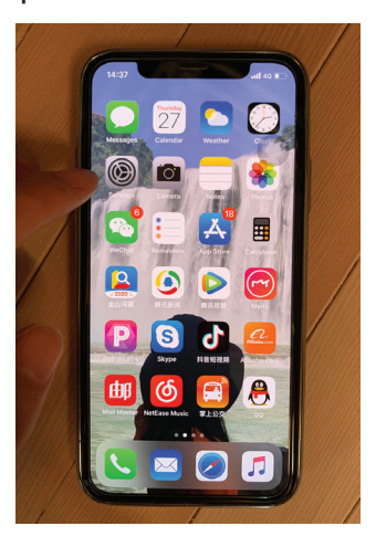
D. Select your music "APP"