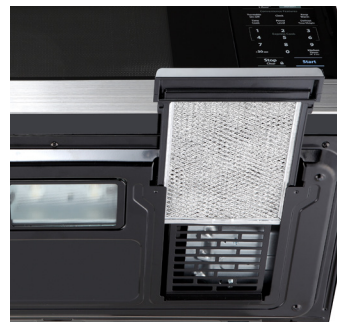
Easy-to-access, sliding grease filters allow for effortless, hassle-free replacement