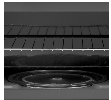
Recessed turntable with On/Off functionality creates an even cavity floor to accommodate cookware as large as 14" x 20"

SHARP ELECTRONICS CORPORATION 100 Paragon Drive, Montvale NJ, 07645 1.800.237.4277 • www.sharppusa.com