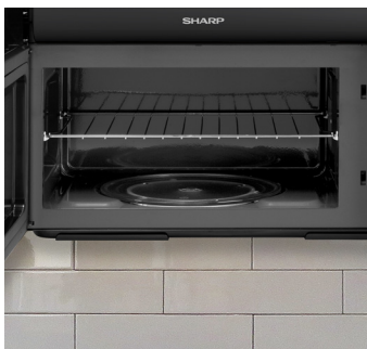
Chrome grill rack accessory included for multi-level cooking and reheating

The powerful, 3-speed ventilation system is effective up-to 450 cu. ft. per minute, and features easy-to-reach, easy-to-replace filters. The Simply Better Clean enamel coating inside the oven is stain resistant and wipes clean with a damp cloth. With decades of experience designing innovative cooking appliances, it's easy to see why cooks around the world trust Sharp.