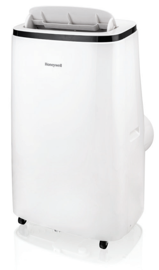
Product Dimensions (in): 18.9 (W) 15.4 (D) 30.7(H) Net Weight: 60lbs

Enjoy year round comfort with this versatile appliance offering 3-in-1 functions. The AC provides powerful cooling in the summer, needed dehumidification during humid seasons and the Fan circulates air for everyday comfort.